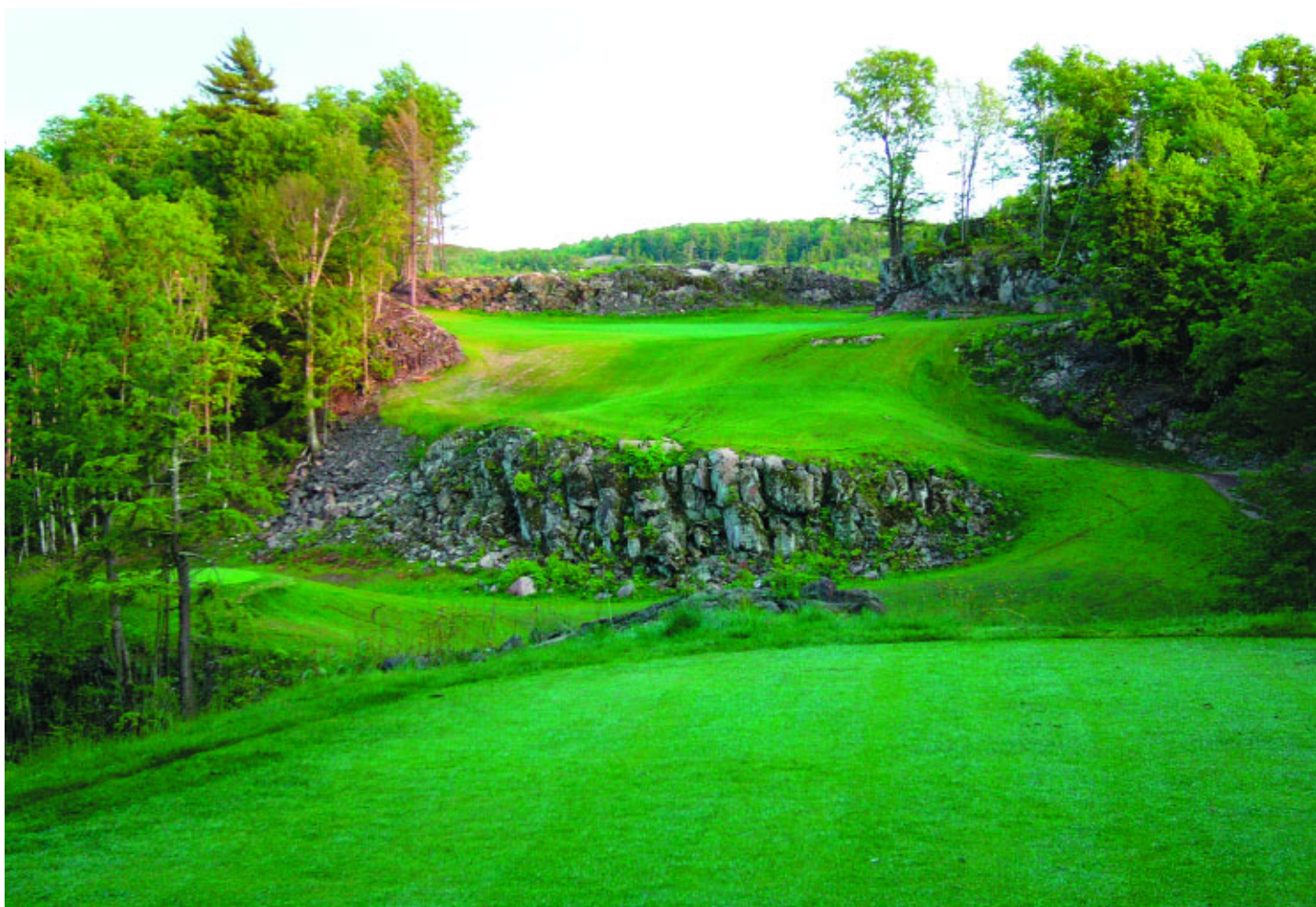
Photo opposite page: Hole Number 5, Greywalls. Photo above: Hole Number 6.