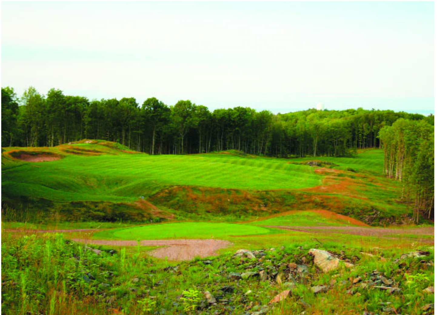
Hole Number 1, Greycalls