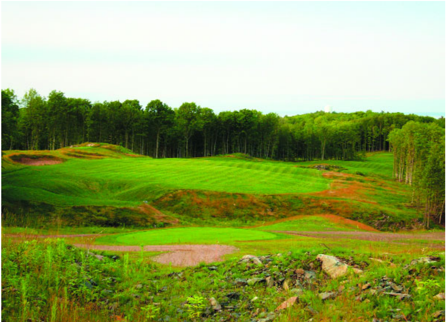
Hole Number 1, Greycwalls