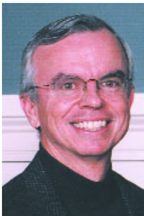
By Terry Moore

I n the interest of full disclosure, I will admit that this column is written in haste but not without forethought.