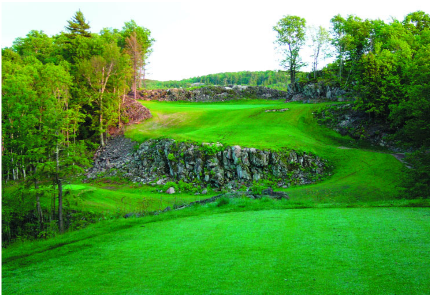
Photo opposite page: Hole Number 5, Greywalls. Photo above: Hole Number 6.