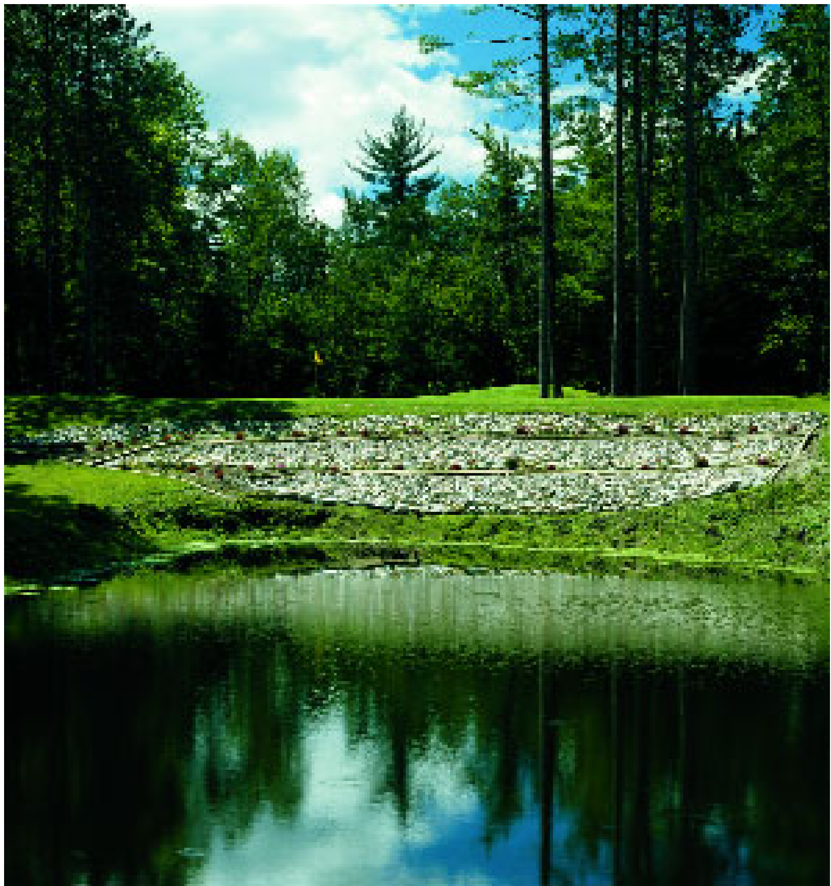
Thunder Bay's Hole Number 17