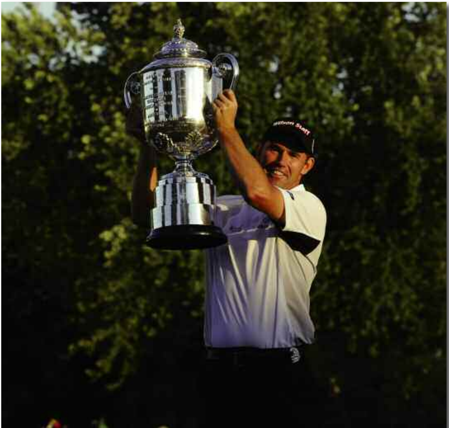
Champion Padraig Harrington with the Rodman Wanamaker trophy at the awards ceremony on the 18th green following the final round of play at the 90th PGA Championship at Oakland Hills Country Club in Bloomfield Township, Michigan, USA, on Sunday, August 10, 2008.

4-3 victory with a par on the 33 rd hole.