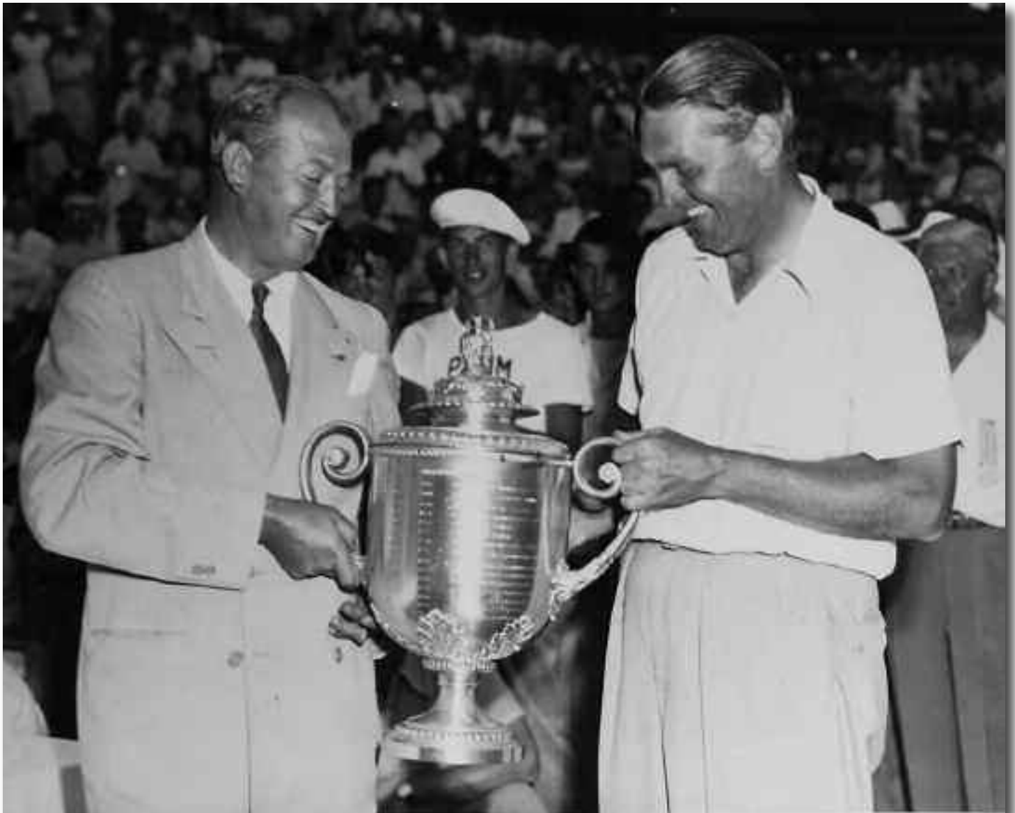
Jim Ferrier, receiving Wanamaker trophy, PGA Championship 1947

Hagen and Jones had retired from competitive golf so they didn't renew some of their famous duels of the 1920s, after one of which Jones, the precisionist, said "When a man misses his drive,