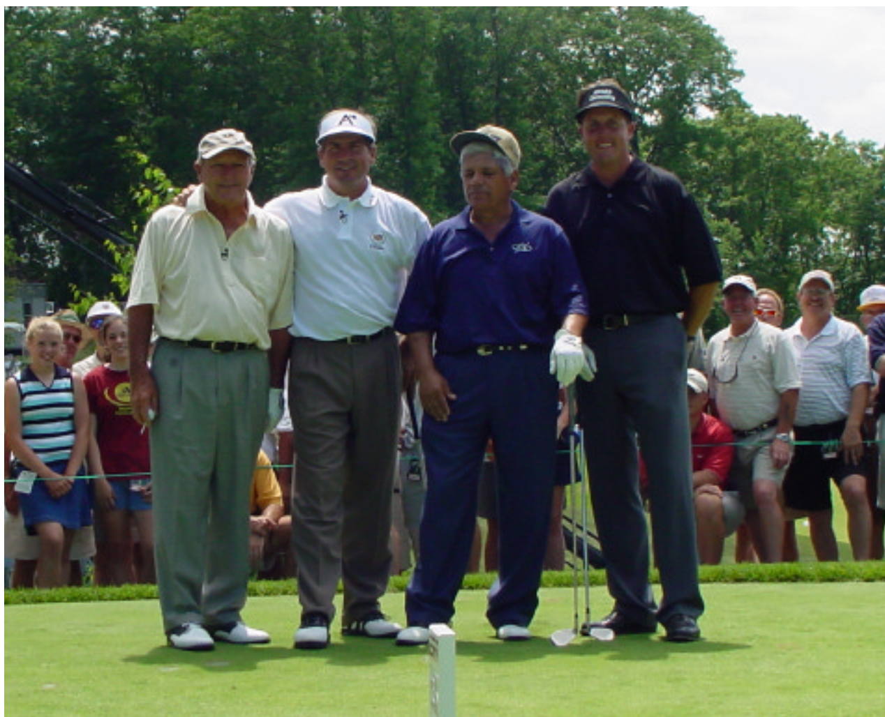
Arnold Palmer, Fred Couples, Lee Trevino and Phil Mickelson compete at the 2002 Par-3 Shootout.

Reigning Masters champion Phil Mickelson will be among the four legends of the game who are scheduled to play in the annual two-day Par-3 Shootout at Treetops in Gaylord. It is slated