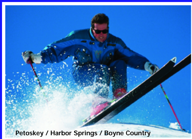
Petoskey / Harbor Springs / Boyne Country