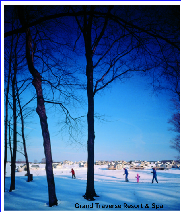
Grand Traverse Resort & Spa