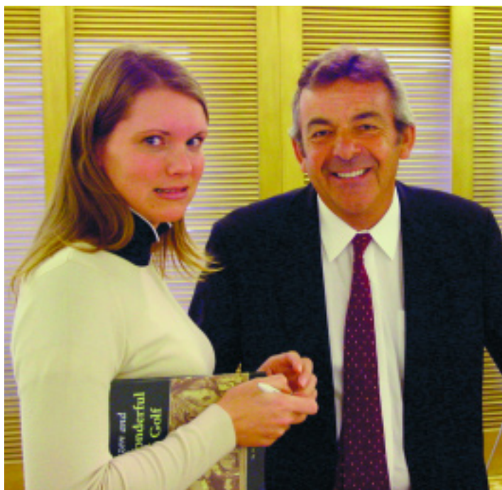
Vanessa Bell & Tony Jacklin