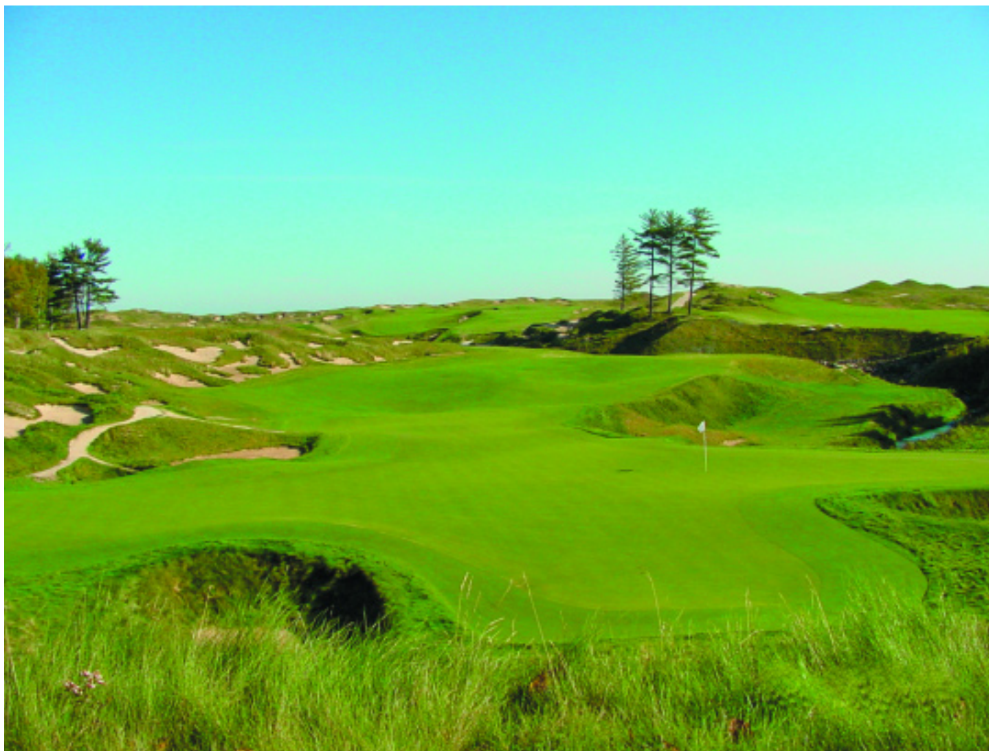
The awesome 18th Hole at Whistling Straits