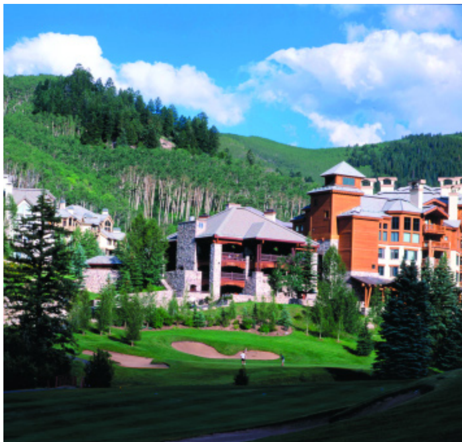
Beaver Creek Resort