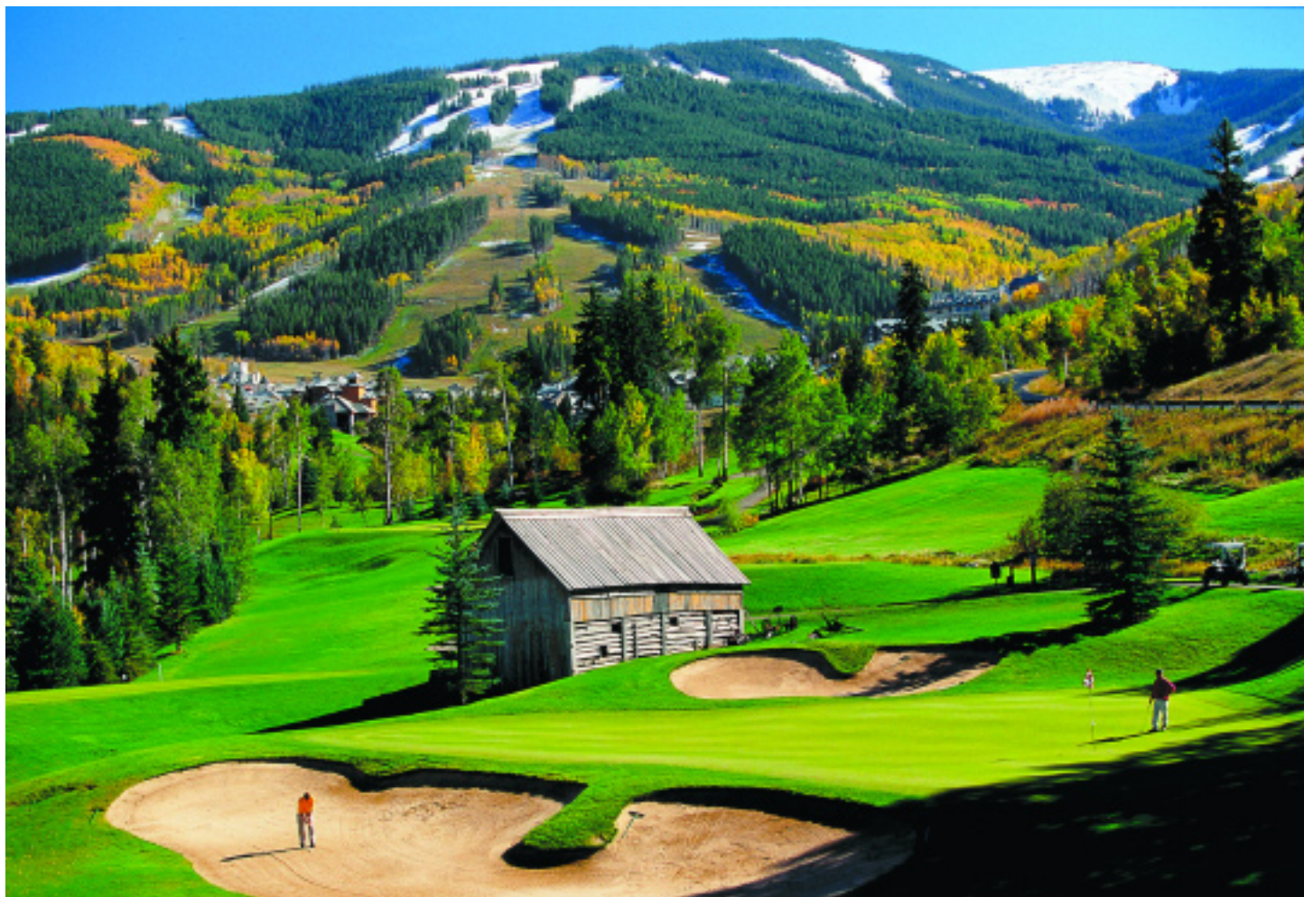
Beaver Creek Resort