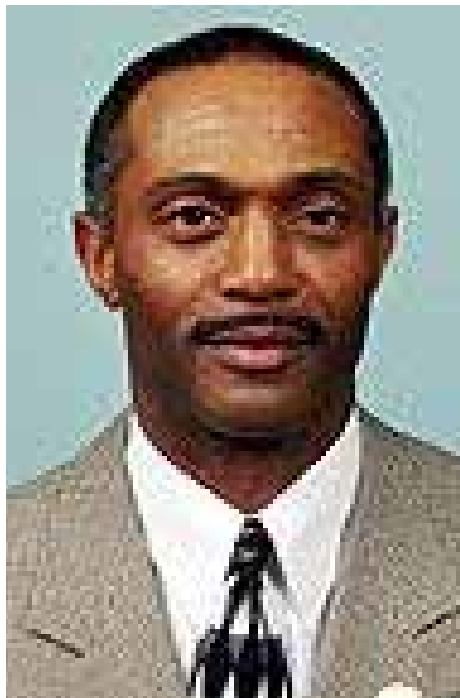
Notre Dame's Tyrone Willingham

Fortunately, I thought, our interview will be conducted in a more pastoral locale—the school's 7,011-yard Warren Golf Course. Surely there, on a gorgeous, demanding layout designed by Ben Crenshaw, away from the football and the memories, Willingham could escape the pressures associ-