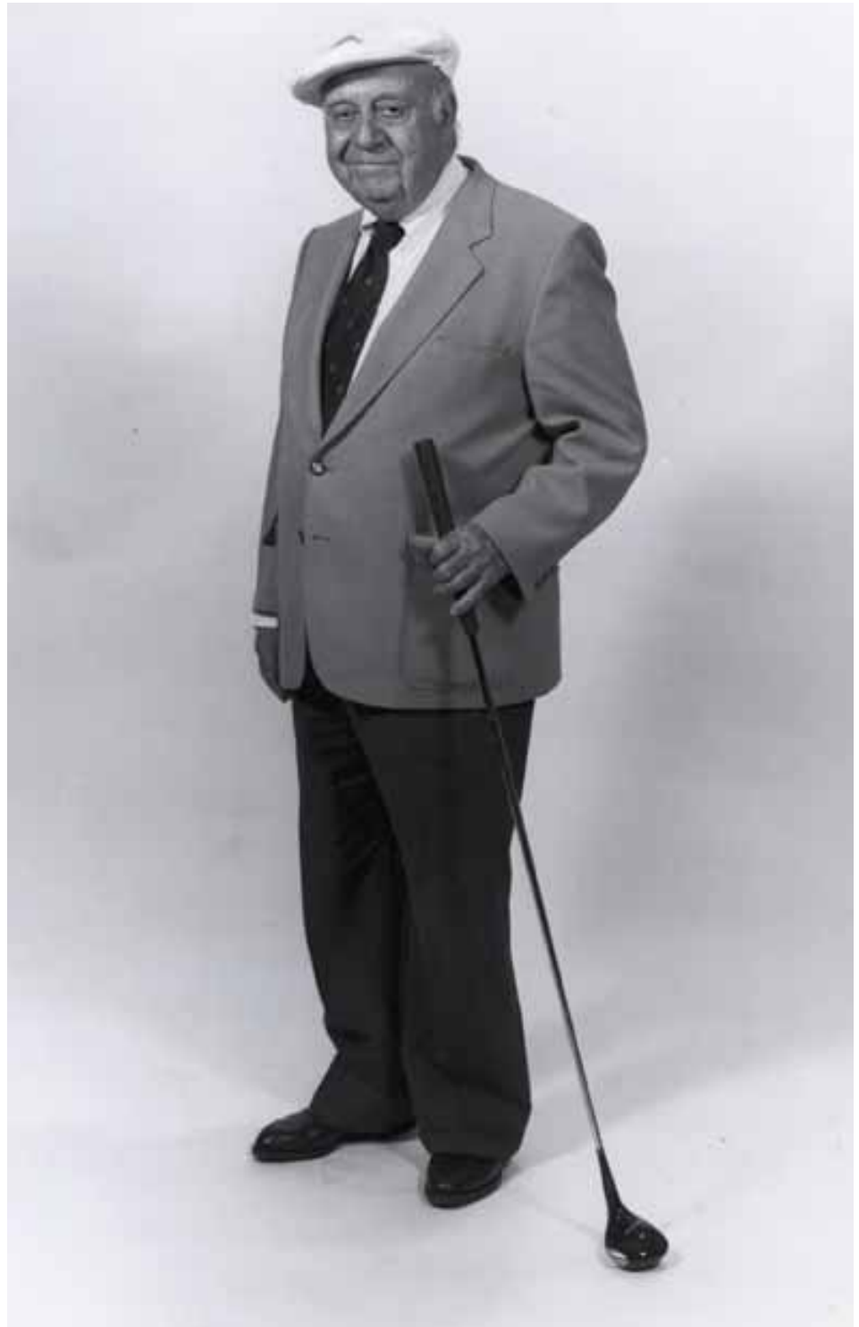
Robert Trent Jones

He was to work with Bobby Jones on Peachtree CC in as well as Augusta National, when he did some work on the 11th and 16th holes. He changed them from indifferent to bold and memorable.