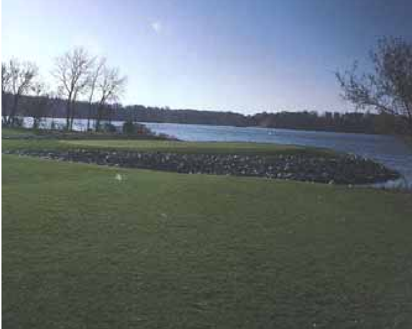
The 16th at Eagle Crest Resort