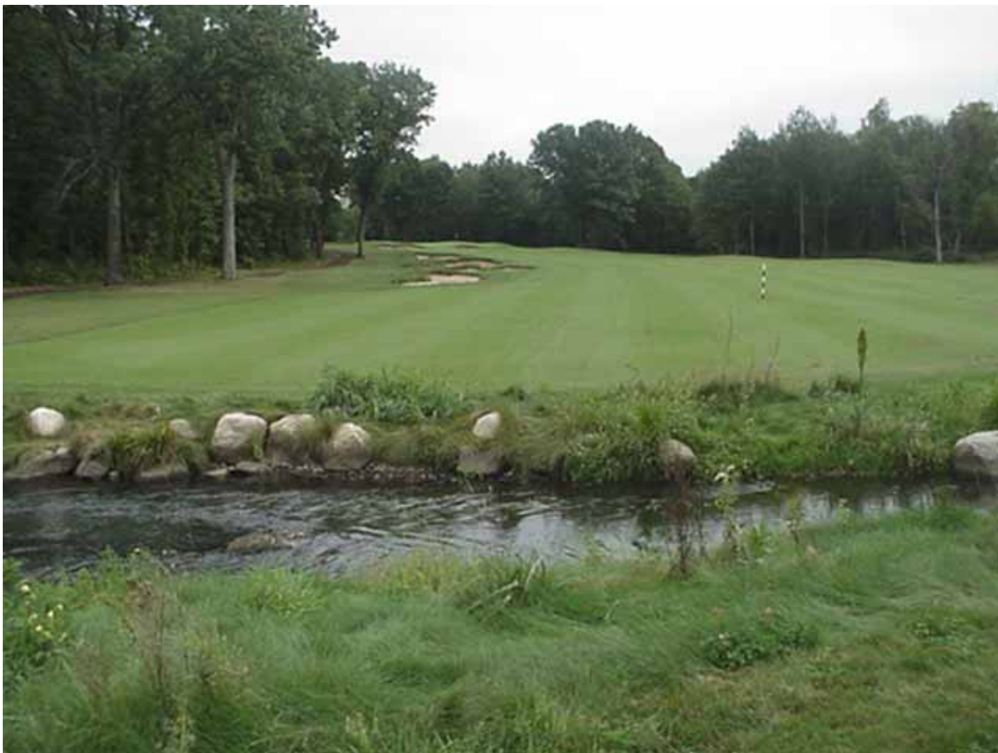
The 16th hole at Notre Dame s Warren Golf Course.

have it in football—develop a strategy, then rely on execution for success or failure.