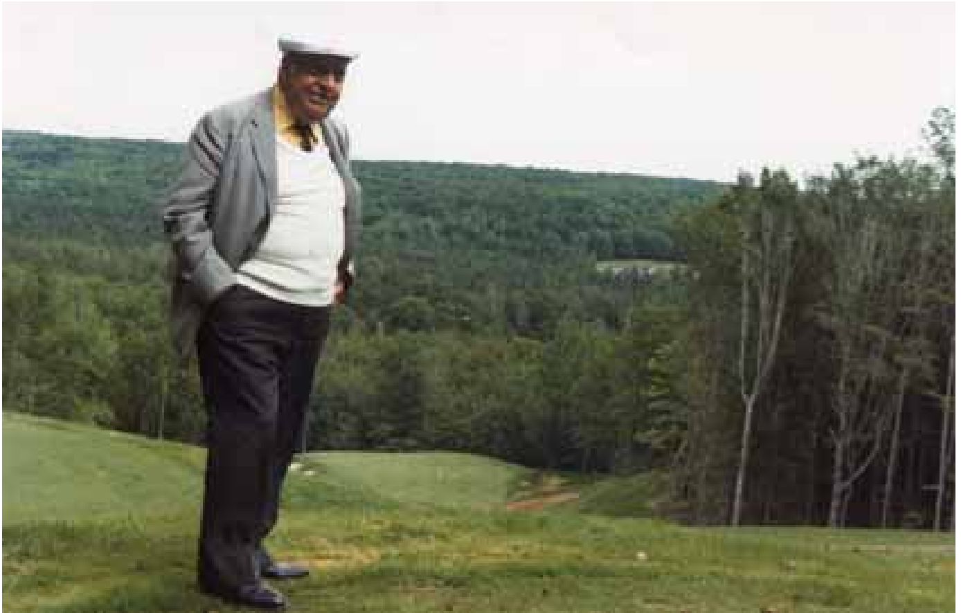
Robert Trent Jones with one of the most famous golf holes in Michigan, the Sixth at Treetops.