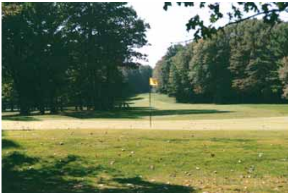
Grand Haven Golf Club